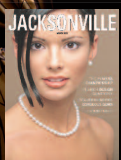
LAURA CROFT July 2008 Playboy Playmate