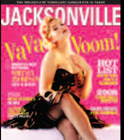
Whitney Thompson America's Next Top Model cycle 10 winner